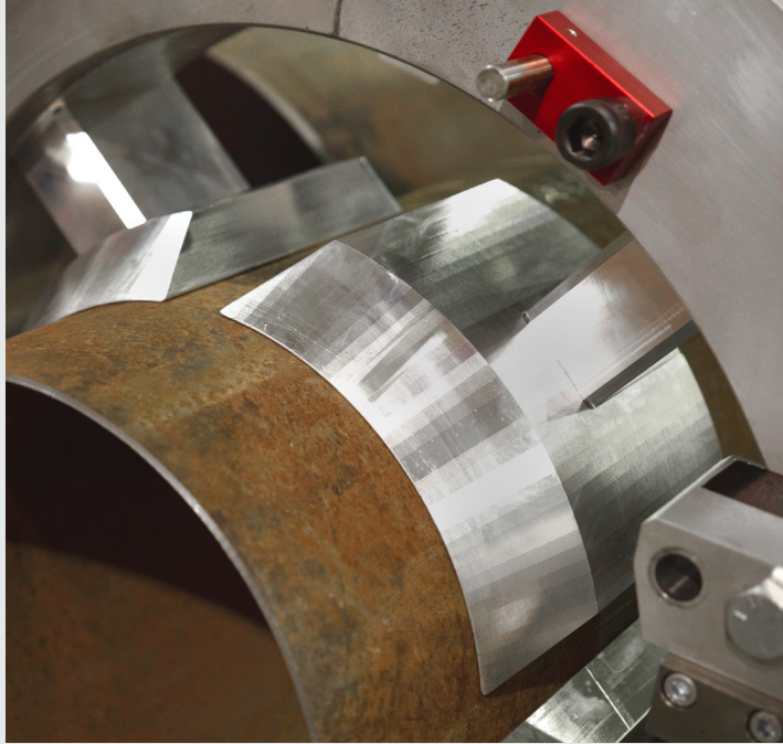
The perfect solution for cutting thin-wall tube & pipe!

New design pad sets cost lower than ever before!