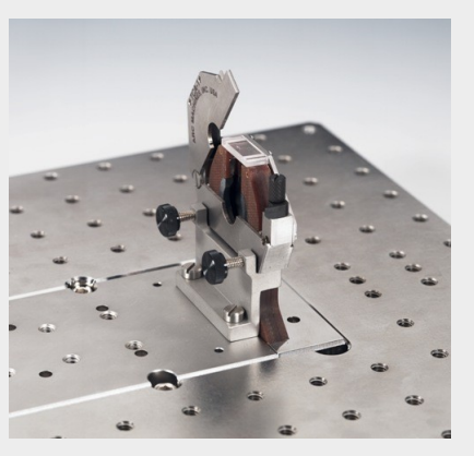
Model 4-500 fitted with Model 9-500TCA (narrow) tooling.