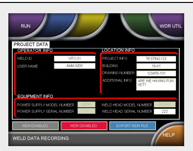
Data entry fields to record all pertinent details