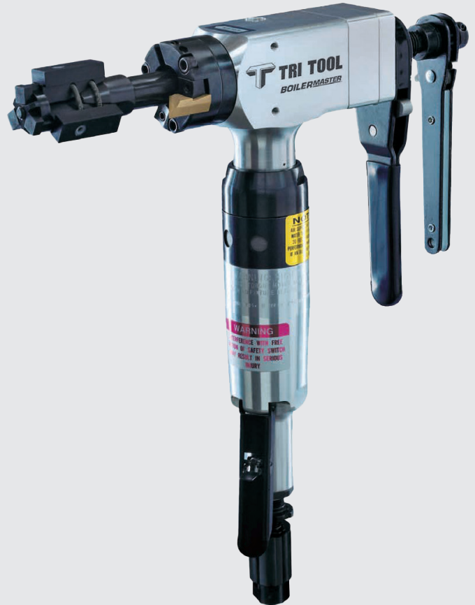
Wide, Standard 1 ¼" to 4" size range