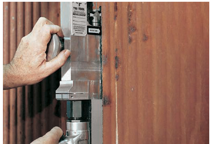
The narrow profile and well-designed controls make the Model 201BA the ideal solution for waterwall weld repair.